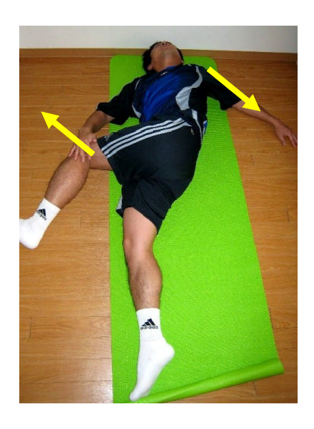
FIFA RAP Physical Instructors